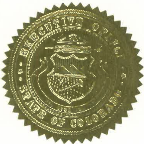
Jared Polis Governor